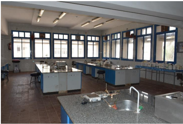
Full natural daylighting (Tanta University, Egypt)