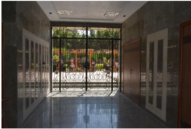
Natural ventilation (Tanta University, Egypt)