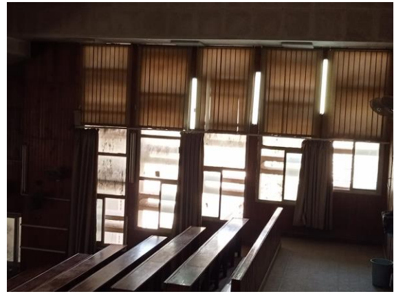
Natural ventilation and full natural dayllighting (Tanta University, Egypt)