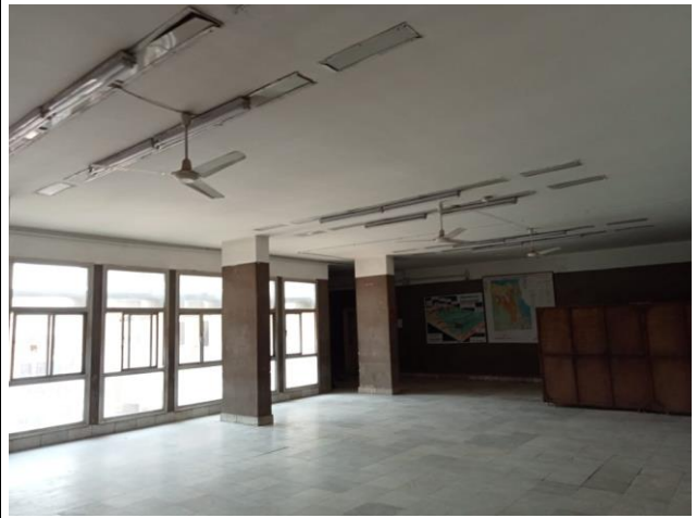
Natural ventilation and full natural daylighting (Tanta University, Egypt)