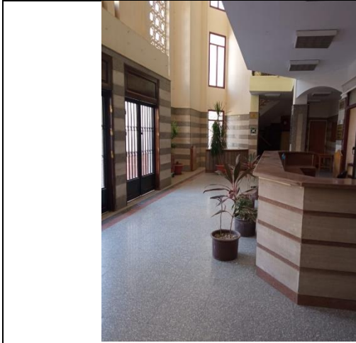
Natural ventilation and full natural daylighting (Tanta University, Egypt)