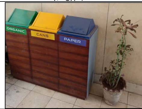
Waste treatment (Tanta University, Egypt)