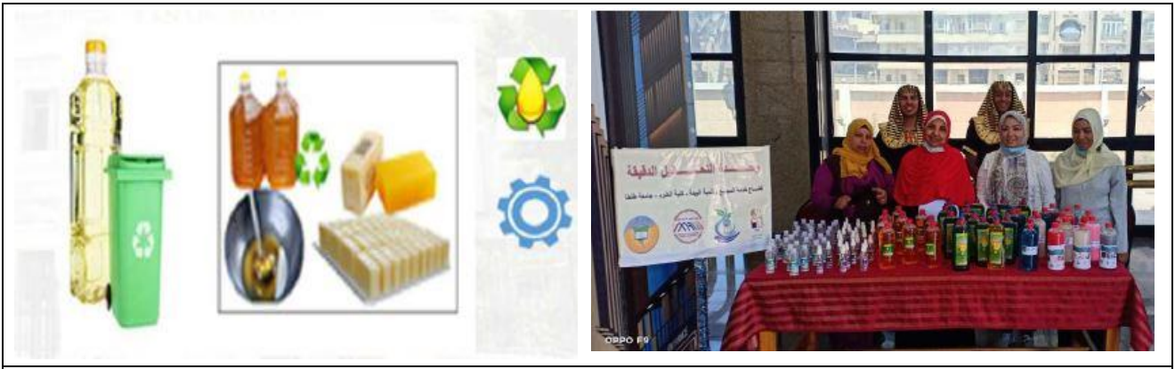
Recycling used vegetable oil (Tanta University, Egypt)