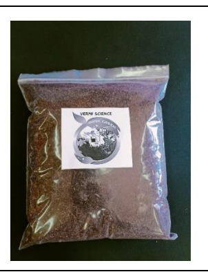
Recycling Organic waste (Tanta University, Egypt)