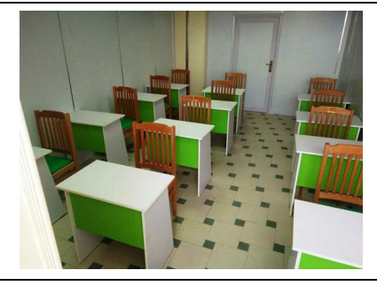
Recycling rice straw and plasctic (Tanta University, Egypt)