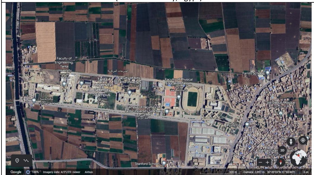
Image for Seberbay campus (Tanta University, Egypt)